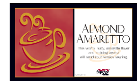
8. Coffee Description Bin Cards (5" x 3")