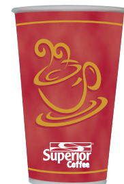
9. Superior Paper Cup