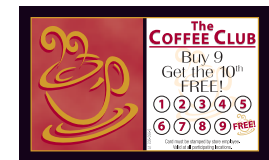
7. Coffee Club Card (5" x 3")