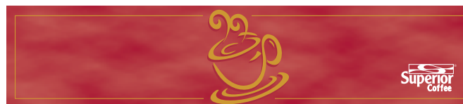
5. Airpot Rack Insert (13" x 3")