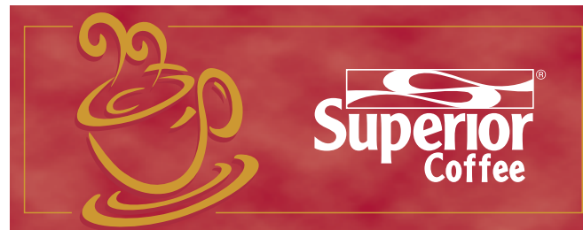
1. Header Card (13 1/16" x 5 1/32")

*Header Card mounted on 13 1/16" x 21 1/16" size board with double face tape