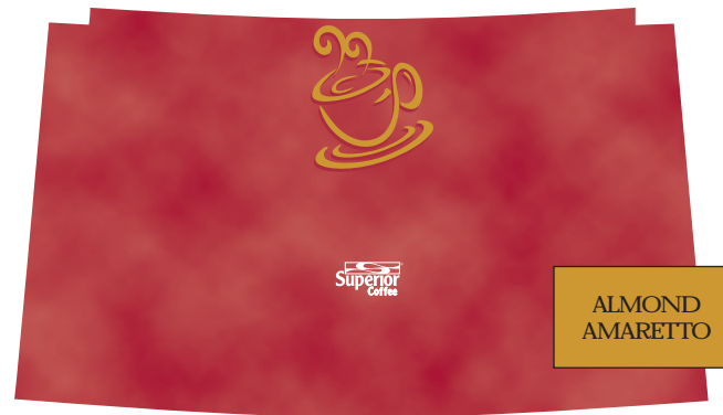
2. Airpot Wrap

*Header Card mounted on 13 1/16" x 21 1/16" size board with double face tape