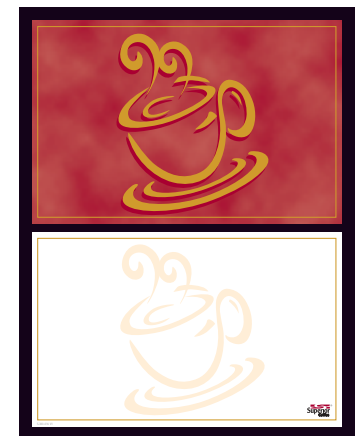
6. Erasable Menu Counter Card (8 1/2" x 11")